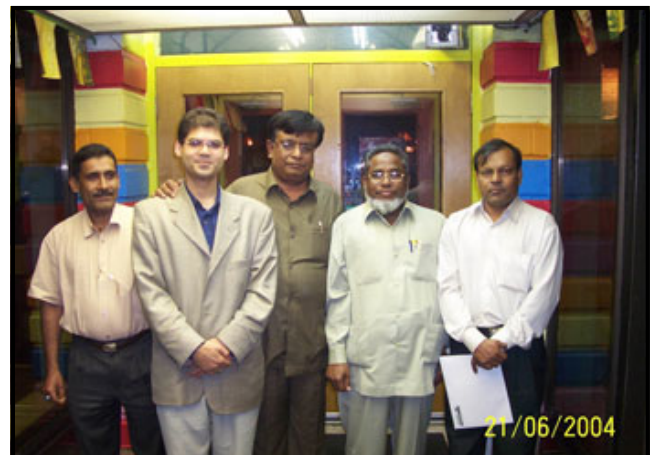
CBBC's Executives with President of Bangladesh Jute Association and President of Manikgonj Chamber of Commerce